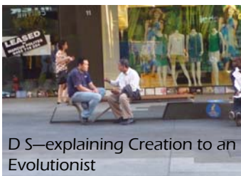
D S—explaining Creation to an Evolutionist