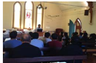
Egyptian youth learning—reaching to Muslims in Sydney